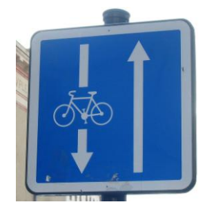
Contra-flow cycling exit sign, Brussels, BE Contra-flow cycling entry sign, Rennes, FR